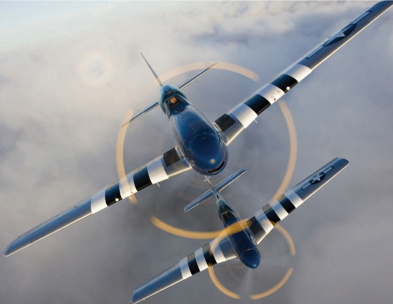
Crazy Horse 1 & 2 playing above the clouds