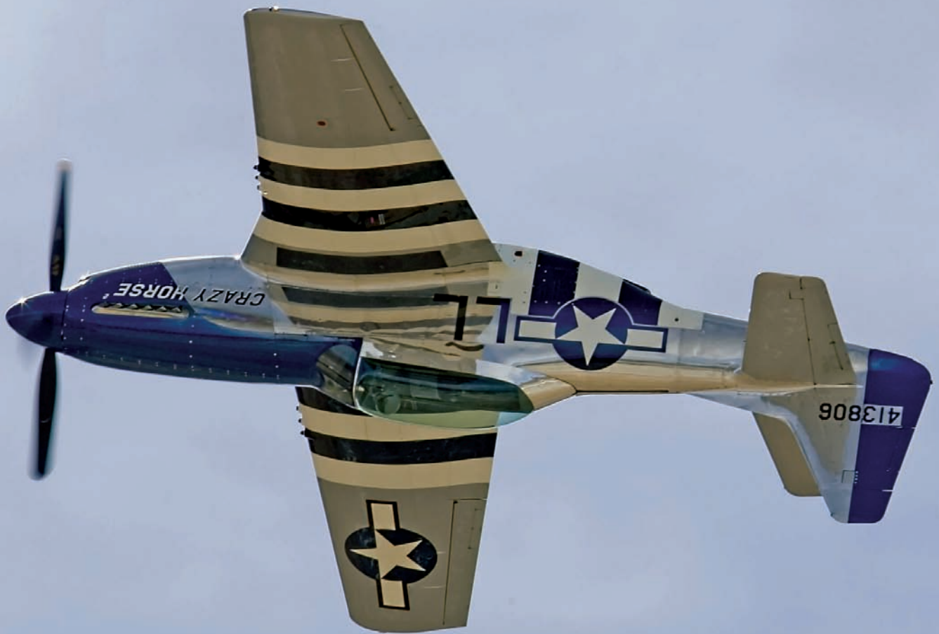
Stallion's Crazy Horse 2 inverted flight

mention the asymmetric prop effect with the nose pointed up and then there's the torque effect trying to roll the plane. If you fail to catch this yaw the aircraft will rapidly swing as the yawing moment exceeds the rudder's ability to correct. Not being able to see over the nose doesn't make life any easier.